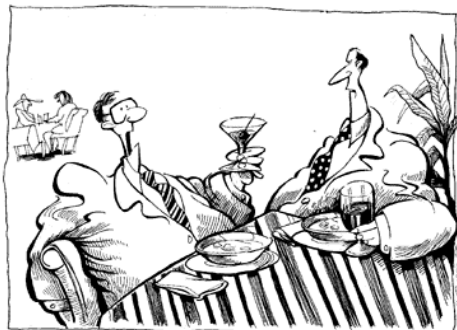
"If we pay them starvation wages— why do they need a lunch break?"